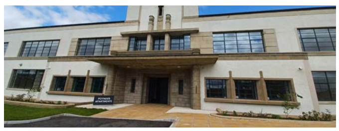
2024 Medium category commendation Eildon Housing Association for Poynder Apartments, Kelso